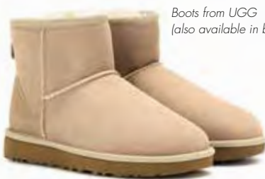
Boots from UGG (also available in black)