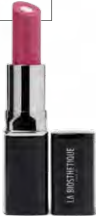
True Color Lipstick Burgundy Plum

The cold season is a challenge for every skin. However, the low temperatures are less of a problem for it than the frequent change between warm and cold. Another stress factor: clammy air binds more pollutants. That is why a perfect day care is a must now – and particularly for sensitive lips. Ideal protection: Color Care Lipstick with a conditioning core.