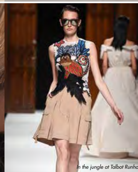
In the jungle at Talbot Runhof