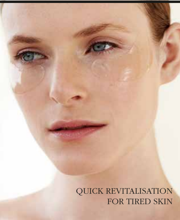
QUICK REVITALISATION FOR TIRED SKIN

When your face is tight, whether after a tiring day or a restless night, the skin often looks paler than usual. The best trick: stimulate the circulation. Vigorously tap the face for one minute with flat hands. An even more intense remedy is a cold shock – with ice-cold compresses or ice-cold water. Masks are also ideal for waking the skin up and stimulating its circulation. If you don't have one, you can also use an oil-based cream by applying a thicker layer than usual. Leave it on for 15 minutes, then wipe away any surplus. And if you have tired eyes, our Patch Gel Liftant will give them a wonderful freshness boost and a spectacular lifting effect.