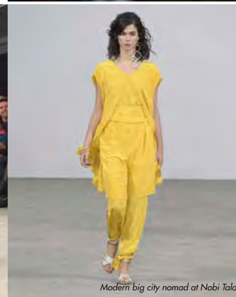
Modern big city nomad at Nobi Talai