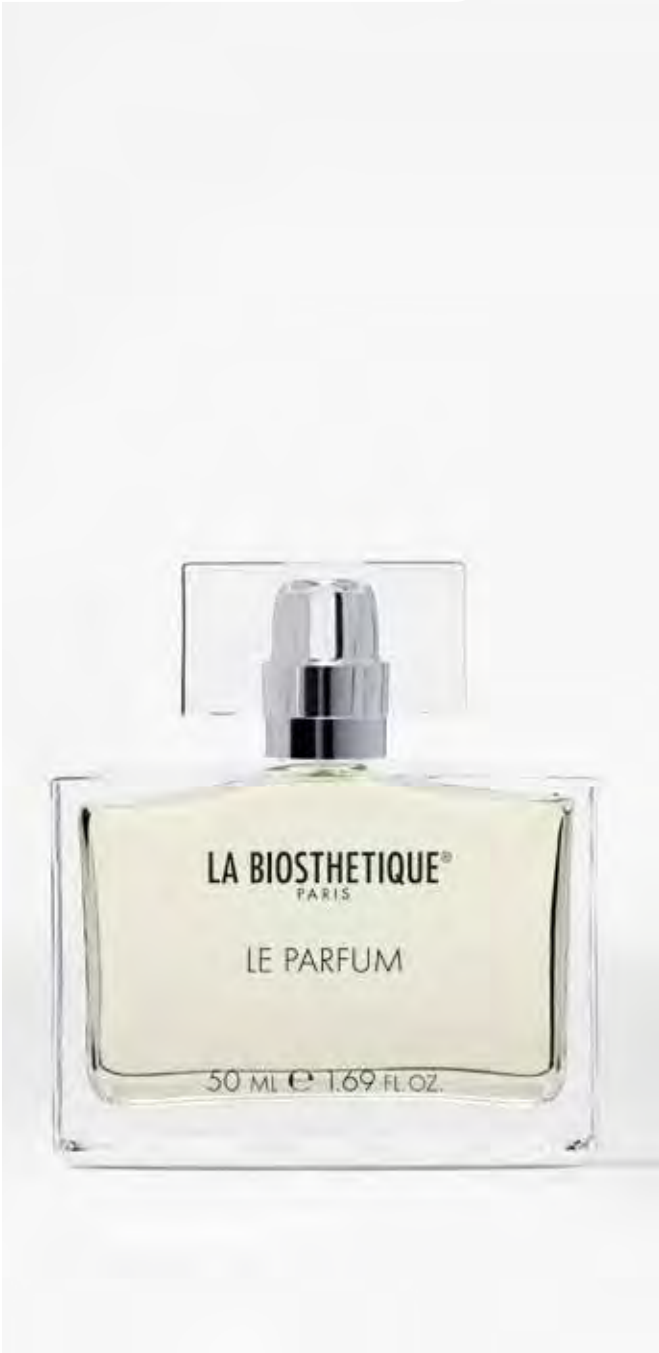
Exclusive hair care and cosmetics. In selected hairdressing salons: www.labiosthetique.com

It is smart and dreamy. It is velvety soft and casually elegant. A captivating feminine scent with many facets and a little secret. Like the woman who wears it.