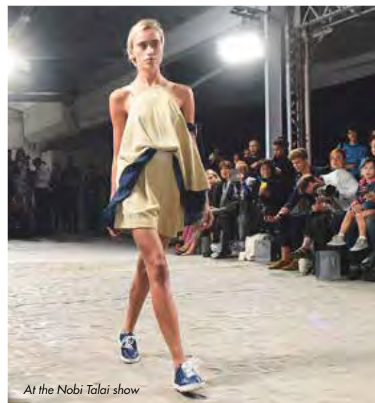
At the Nobi Talai show