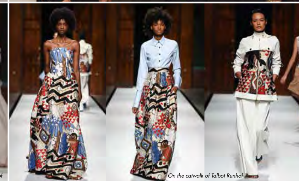
On the catwalk of Talbot Runhof