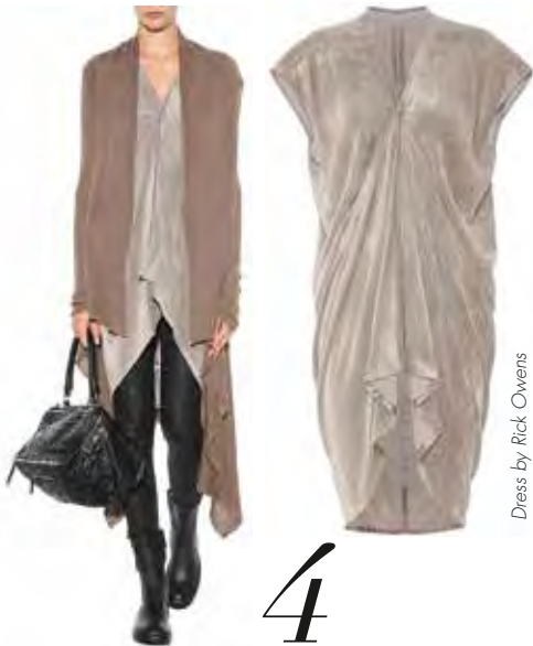
Dress by Rick Owens

SOFT STYLE FLOWING SILK AND VELVET IN DELICATE ROSE. MORE FEMININE THAN EVER! IN ADDITION TO BRIGHT GEMSTONE COLOURS, PRINTS AND EMBROIDERY, PASTEL SHADES ARE A HIGHLIGHT OF THIS VELVETY SOFT FASHION. AND WHOEVER FINDS THIS TOO GIRLY CAN CASUALLY BALANCE IT OUT WITH THE CONTRASTING COLOUR BLACK.