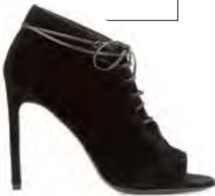
High Heel from Saint Laurent

Velvet from head to toe is normally reserved for glamorous evening outfits. But this is not the case with this crushed velvet high-gloss trouser suit. Although it's not suitable work wear, it's a glamorous and cool eyecatcher in every bar.