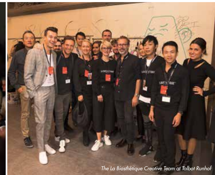
The La Biosthétique Creative Team at Talbot Runhof