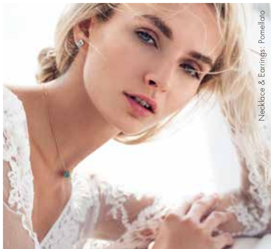
Necklace & Earrings: Pomellato

Here is another winter issue of Salon Beauté. As the year draws to a close, you might expect topics and inspiration on the festival of love, i.e. Christmas, and new beginnings for the New Year. In actual fact, this entire issue is all about the celebration of love and the beginning of a new chapter. But instead of singing Christmas carols, we are humming The Wedding March, and we have swapped out our snowy landscapes for white lace and chiffon. The topic is weddings. This celebration of the love of two people and them beginning a future together is wonderfully fitting for a winter issue, don't you think?