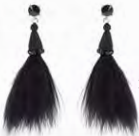
Earrings: Oscar de la Renta, www.mytheresa.com

Wedding dress: Kaviar Gauche www.kaviargauche.com Earrings: Oscar de la Renta Shoes: Steve Madden