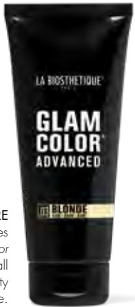
COLOUR CARE The seven shades of Glam Color Advanced give all hair colours intensity and glamorous shine.

Months before the wedding, you decide on the colours for the location and the wedding table.