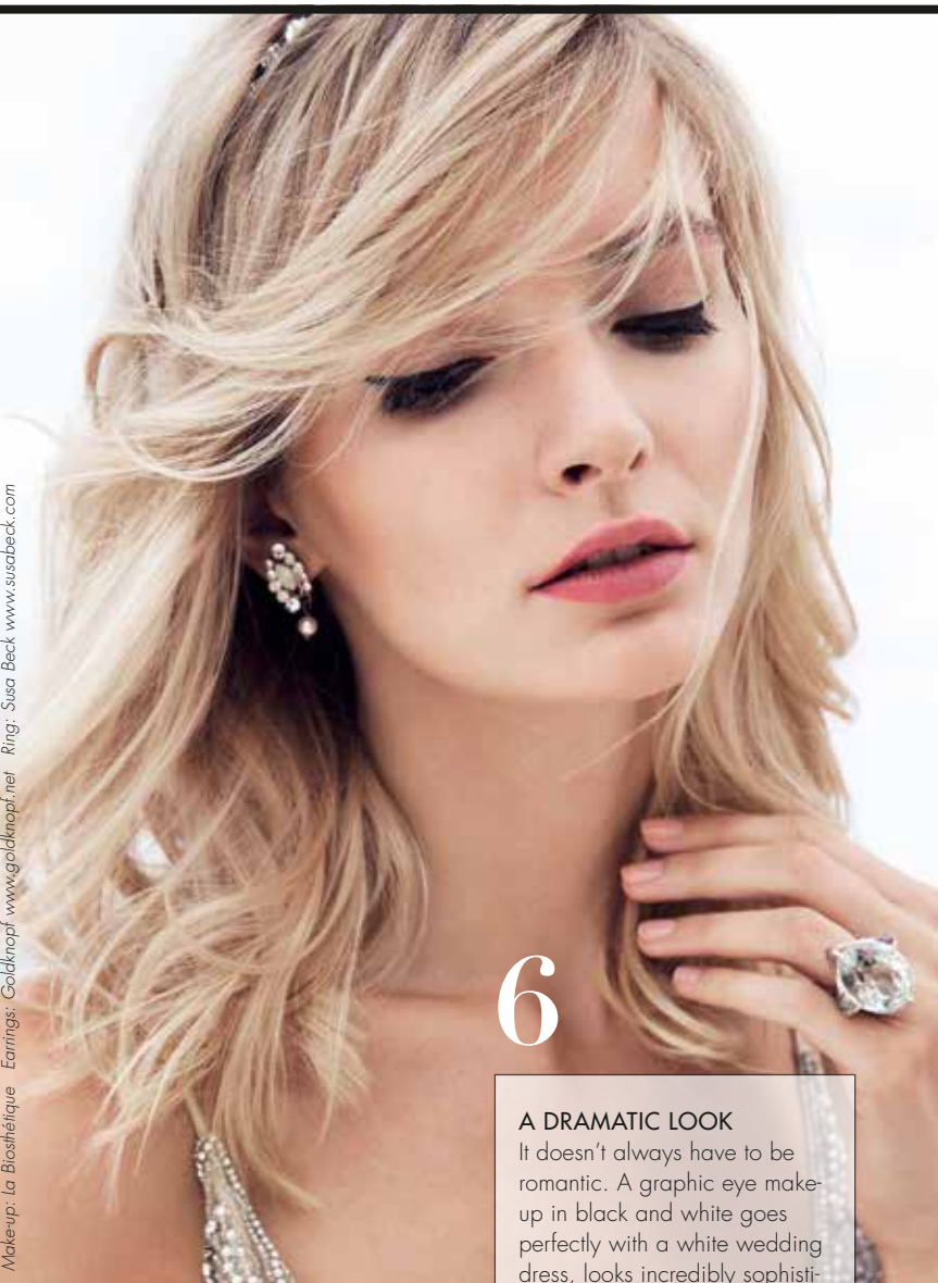
Make-up: La Biothétique Earrings: Goldknopf www.goldknopf.net Ring: Susa Beck www.susabeck.com