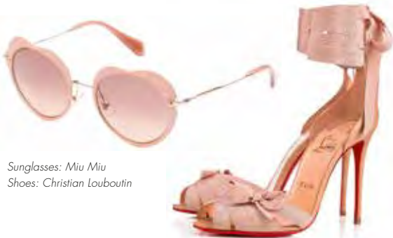
Sunglasses: Miu Miu Shoes: Christian Louboutin

OUI! YES. JA. SI. OUI. OFTEN IT IS THE SHORTEST WORDS THAT CARRY THE MOST MEANING. DESIGNER ELIE SAAB TURNED THE LIFE-CHANGING MONOSYLLABIC «YES» INTO PIECES OF JEWELLERY. AS A RING OR ARMLET SIMPLE GOLDEN LETTERING REMINDS YOU IN A DECORATIVE AND CHARMING WAY OF YOUR WONDERFUL WEDDING VOWS.