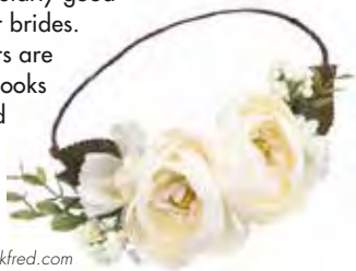
Floral garland: Clara Peony, www.silkfred.com

Floral garlands are a wonderfully romantic and currently very trendy alternative to wedding veils, and a particularly good idea for spring and summer brides. Whether real or fake flowers are used is a matter of taste. It looks best when the floral garland and bridal bouquet match.