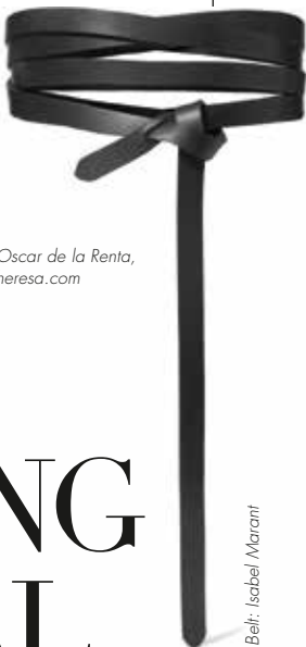
Belt: Isabel Marant