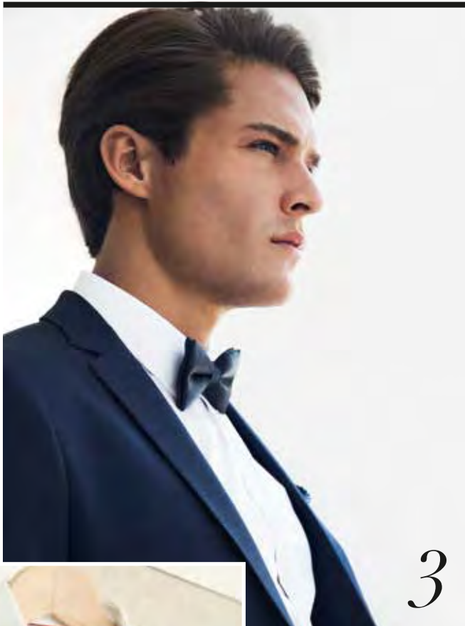
Suit: Cinque www.cinque.de Shirt & bowtie: Hugo Boss www.hugoboss.com

Something old, something borrowed ... What is considered lucky for the bride on her wedding day is definitely different when it comes to the groom's suit. A hired suit or a suit that's been hanging at the back of your wardrobe for years is definitely not an option for the wedding. You can bet that neither one of the two fits well. An ill-fitting suit can easily make you look five to ten kilos heavier in wedding photos. That's a good enough reason to invest in a good quality, perfectly fitting two- or three-piece suit for your special day. This is a purchase that will also pay off after the wedding for chic events or job interviews.