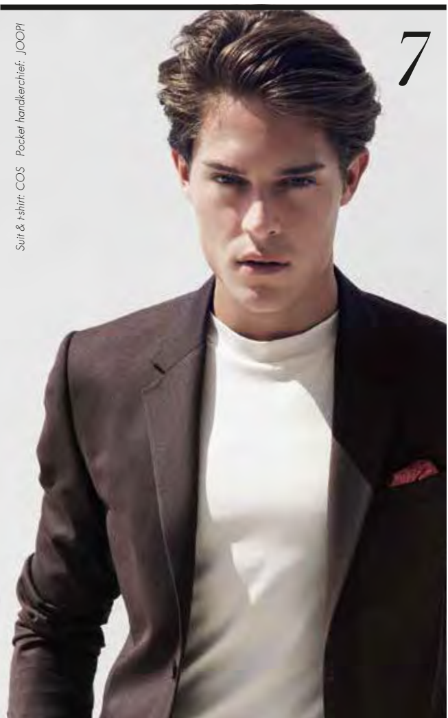
Suit & t-shirt: COS Pocket handkerchief: JOOP!

Do you request «the same as always» when you go to the hairdressers? If so, stick with the same thing on the day of your wedding, and don't suddenly ask the hotel hairdresser or local barber to give you a new look. It's better to consult with a hairdresser you trust or to try something new a month before your special day. If you like the new cut, you can have it trimmed the week before your wedding. Otherwise, there's enough time to grow out your failed experiment.