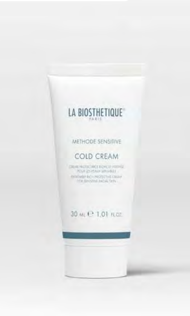
Exclusive hair care and cosmetics. In selected hairdressing salons: www.labiosthetique.com

Coat, hat and gloves protect you from the rough winter weather. Only the face is completely at the mercy of cold, wind and sun. With a rich cocktail of oat lipids, almond oil and beeswax, the new Méthode Sensitive Cold Cream surrounds the skin like a calming protective coat, strengthens its barrier function and actively combats dryness.