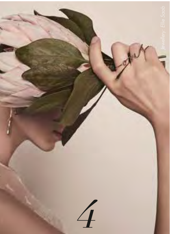
Jewellery: Ellie Saab